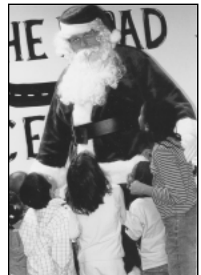
Already excited children were thrilled when Santa put in an appearance at their party.