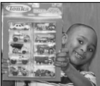
What boy doesn't love cars? The more the merrier.