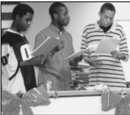
It wouldn't be Christmas without carols.